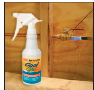
With Cool Gel

Cool Gel™ is a Registered Trademark of LA-CO Industries Inc.