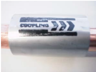
With arrows facing solder joint, slide over until flush with coupling