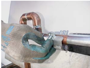
Spread open bottom section of clamp with nut facing out and slide on bottom half of clamp over top rubber section with arrows visible in the opening of bottom section.