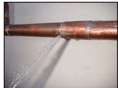
Leak at solder joint in copper pipe