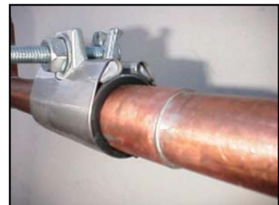
Insta-Clamp™ repair seals leak