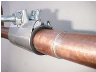
Retighten after 20 minutes...Leak is stopped!