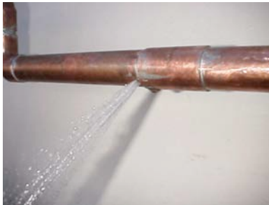
Leak at solder joint in copper pipe

(*** Lightly lube the 4.00" Insta-Clamps between nut and washer to prevent binding ***)