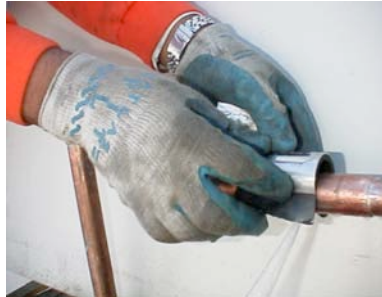
Loosen the bolt and separate the two parts of the clamp. Snap top half of clamp with rubber directly over leak