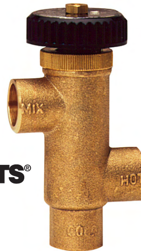
Thermostat and Bonnet Assembly